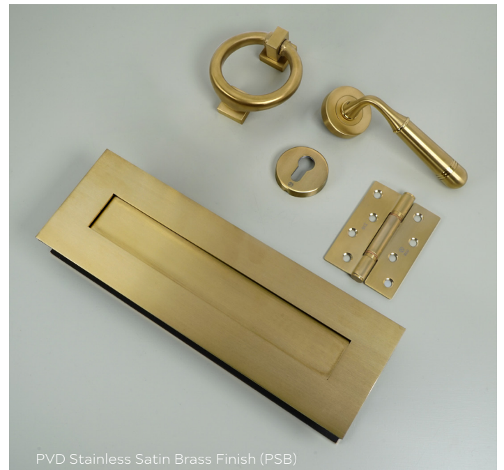
PVD Stainless Satin Brass Finish (PSB)

This Suited Range includes our Opera Lever Door Handle and features a classic bulb-end design. Suitable for lever operated multipoint locks.