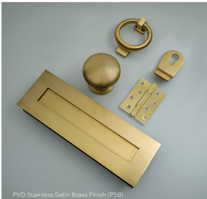
PVD Stainless Satin Brass Finish (PSB)