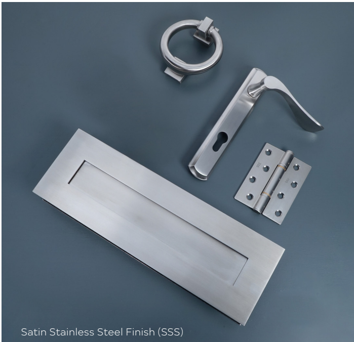
Satin Stainless Steel Finish (SSS)

This Suited Range includes our Regent Lever Door Handle and features elegant styling to create that classic look. Suitable for lever operated multipoint locks.