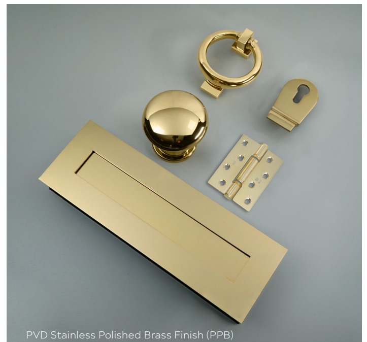
PVD Stainless Polished Brass Finish (PPB)