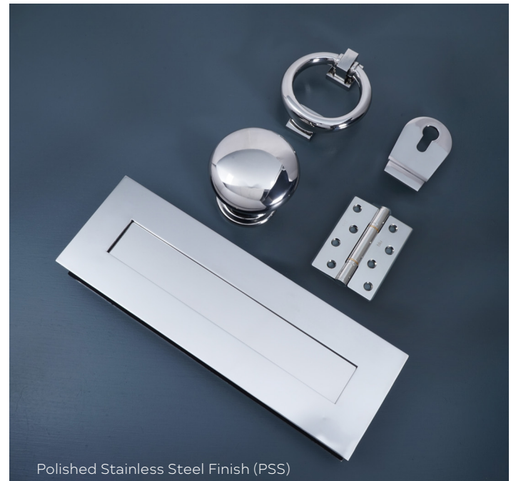
Polished Stainless Steel Finish (PSS)