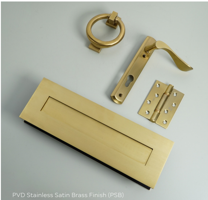
PVD Stainless Satin Brass Finish (PSB)