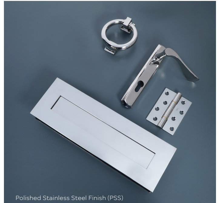
Polished Stainless Steel Finish (PSS)