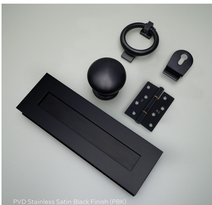
PVD Stainless Satin Black Finish (PBK)

Suitable for non-lever multipoint locks.