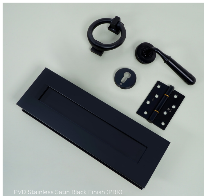
PVD Stainless Satin Black Finish (PBK)