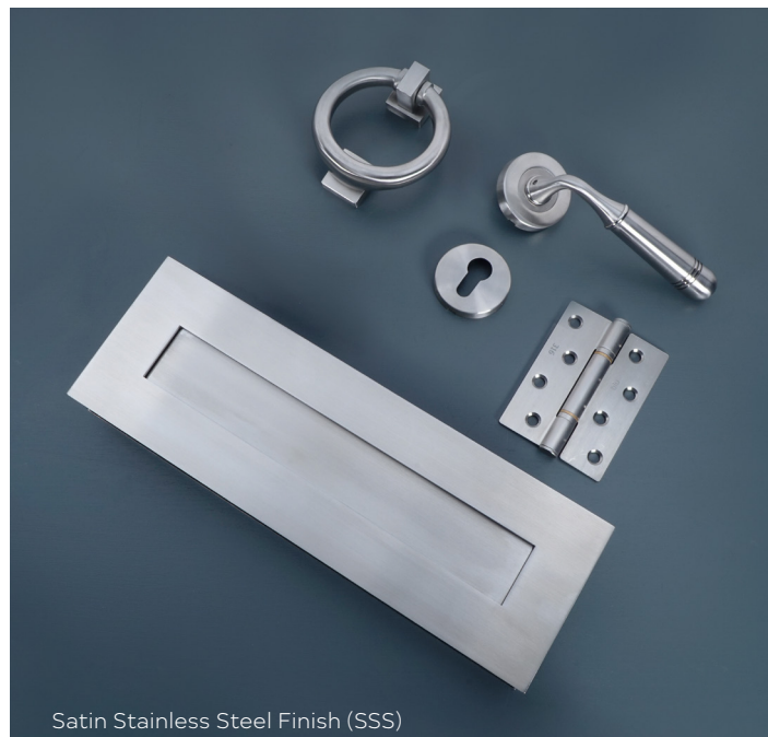
Satin Stainless Steel Finish (SSS)