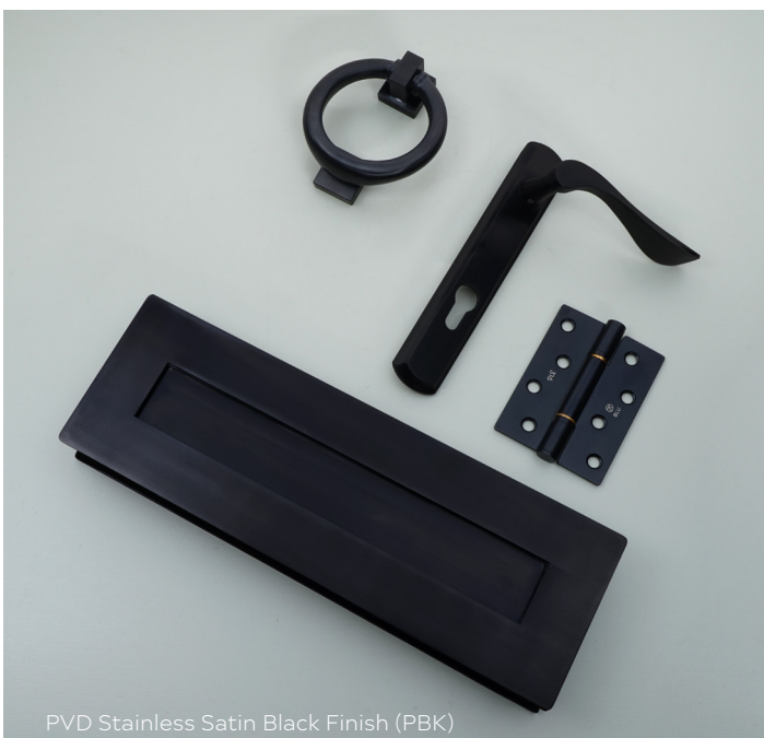
PVD Stainless Satin Black Finish (PBK)

The gentle sweeping curves make the Regent Handle aesthetically pleasing to the eye and ergonomically comfortable to handle.