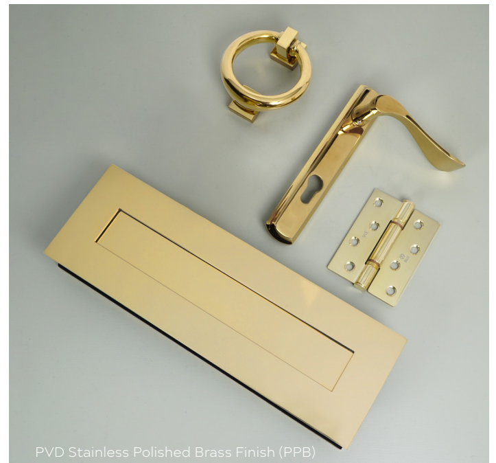
PVD Stainless Polished Brass Finish (PPB)