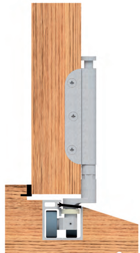
(Standard hinge option shown)

**End hanger set for a pair of meeting doors