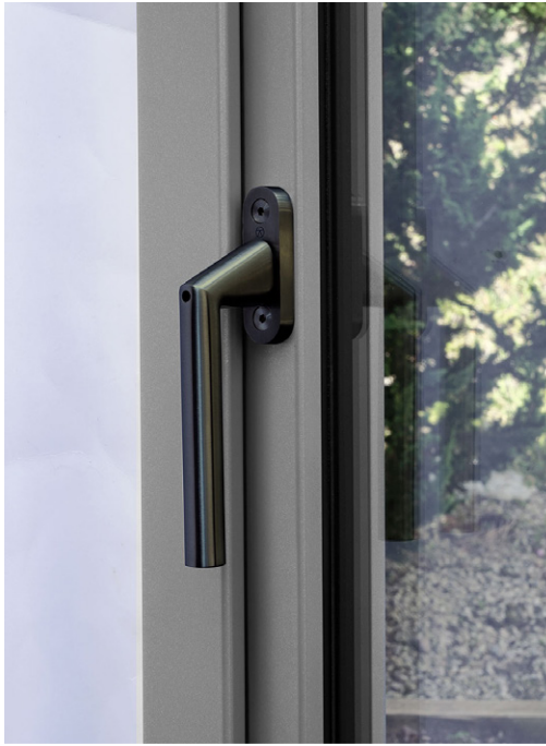
SST87 Suited Contemporary Window Handle available