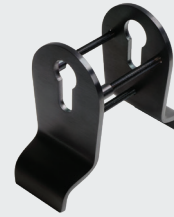
CP30 - Classic Cylinder Pull in PVD Stainless Satin Black