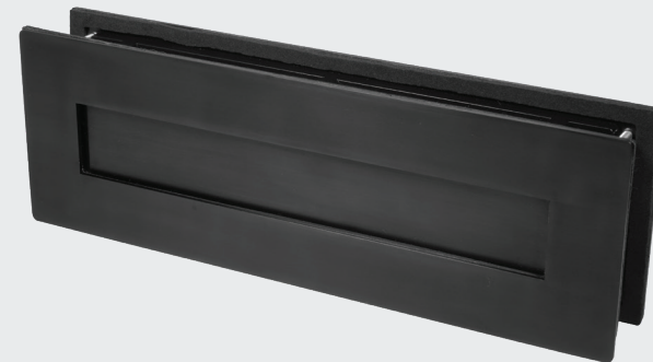
LP400 - Sleeved Letter Plate in PVD Stainless Satin Black

For more information on each product visit: coastal-group.com