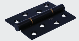
HQ4 - Butt Hinge Square Corner in Matt Smooth Black