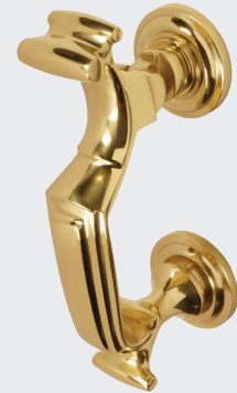
DKB192 - Doctor's Front Door Knocker in Polished Brass Coated