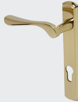
REG090 - Regent Lever Door Handle in PVD Stainless Polished Brass