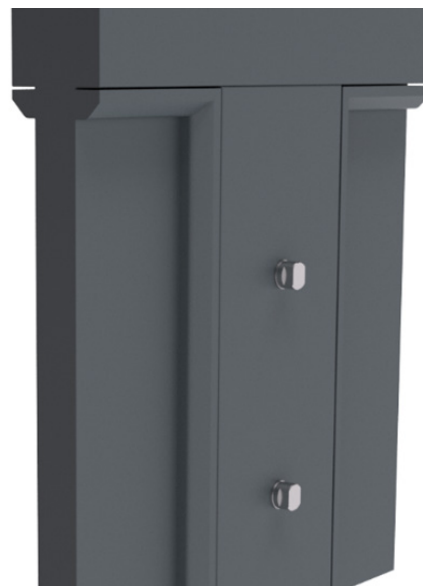
Inside of door

You have now successfully installed the DKB195 door knocker.