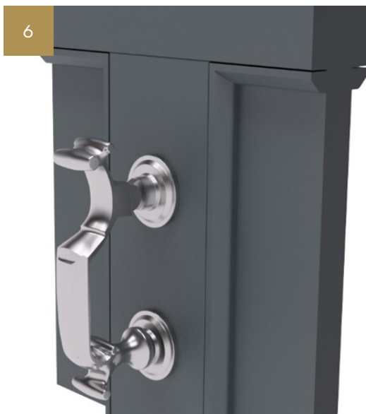
Outside of door

NOTE: if the bolt is too long the door knocker hanger plate will not sit flush against the door.