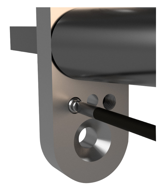
Screw the peg in so the thread site about flush to the backplate and the head is protruding out.