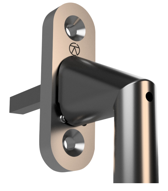
Now the lever will not travel past the verticle position.