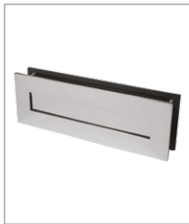
PSS Polished Stainless Steel