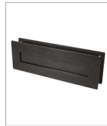
PBK PVD Satin Black