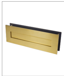
PSB PVD Satin Brass