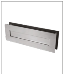
SSS Satin Stainless Steel