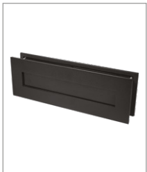
TMB Textured Matt Black