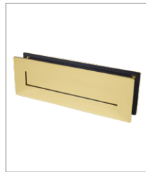
PPB PVD Polished Brass