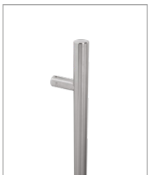
SSS Satin Stainless Steel