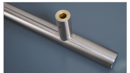
Brass bush fixing ferrules to prevent handles from coming loose

T 01726 871 025 E sales@coastal-group.com W coastal-group.com