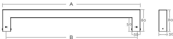
A = Overall Length B = Fixing Holes