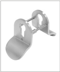
SSS Satin Stainless Steel

Visit www.coastal-group.com for CAD drawings