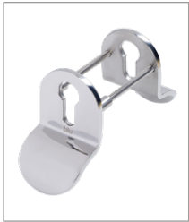
PSS Polished Stainless Steel