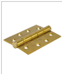
PPB Polished Brass