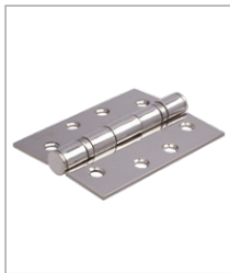
PSS Polished Stainless Steel