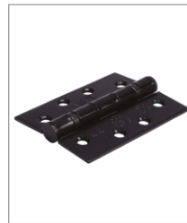
MBK Matt Black