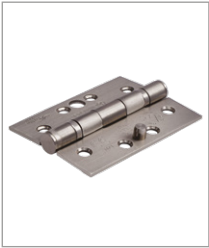
SSS Satin Stainless Steel

Visit www.coastal-group.com for CAD drawings