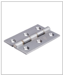
SC Satin Chrome