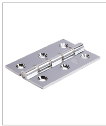
CP Polished Chrome