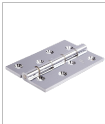
CP Polished Chrome