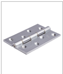
SC Satin Chrome