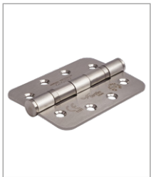
SSS Satin Stainless Steel