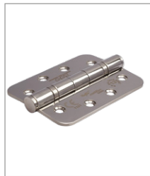
PSS Polished Stainless Steel