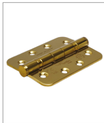
PPB Polished Brass