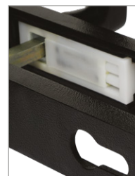
HD Spring Cassette