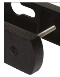
Stainless Steel Fixing