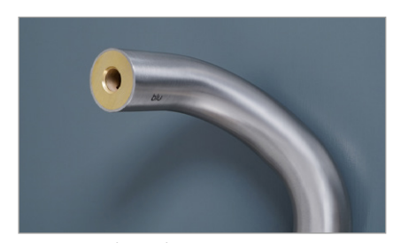
Brass bush fixing ferrules to prevent handles from coming loose