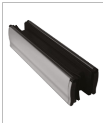
PSS Polished Stainless Steel