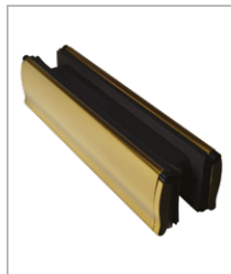
PPB Polished Brass PVD Stainless Brass