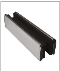
SSS Satin Stainless Steel