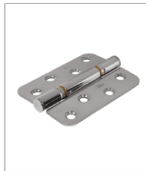
PSS Polished Stainless Steel