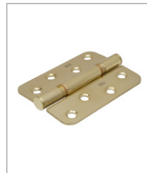
PPB PVD Polished Brass