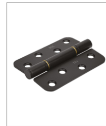
MSB Matt Smooth Black