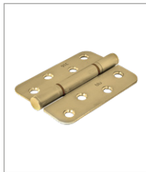
PSB PVD Satin Brass