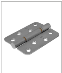
SSS Satin Stainless Steel