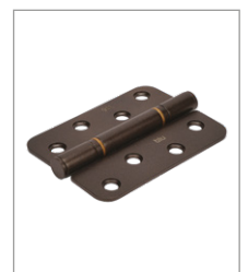
ORB Oil Rubbed Bronze

Note: Matt Smooth Black, White & Oil Rubbed Bronze hinges are not supplied with fixings you need to use code FX-RHF530