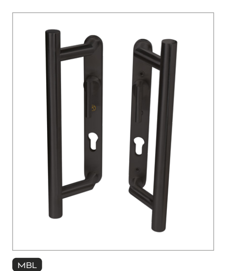
Matt Black Lacquer