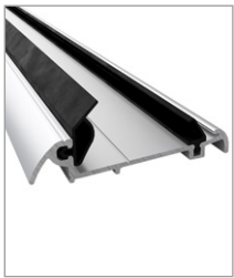
SV Silver Passivated