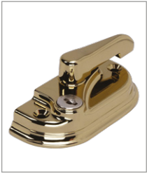
PB Polished Brass