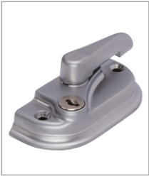
SC Satin Chrome

Visit www.coastal-group.com for CAD drawings