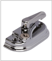
CP Polished Chrome