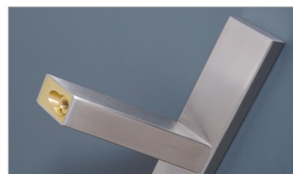
Brass bush fixing ferrules to prevent handles from coming loose