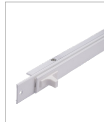
AAL Anodised Satin Aluminium

Should be fitted with TVR Canopy to achieve EA Air Flow Figures