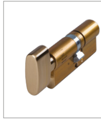
SB Satin Brass