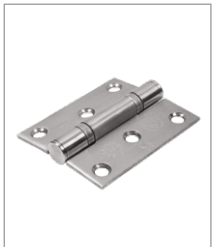
SSS Satin Stainless Steel