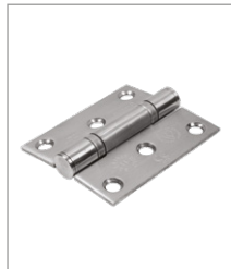
PSS Polished Stainless Steel