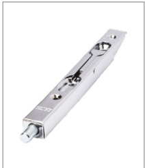
SV Silver Passivated