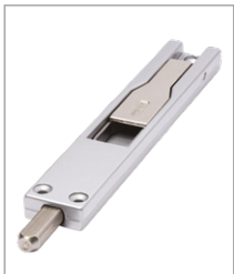
SV Silver Passivated