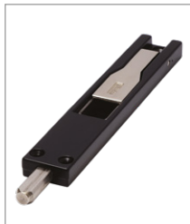
MSB Matt Smooth Black