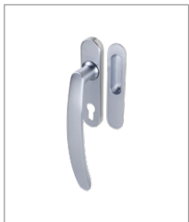
SC Satin Chrome