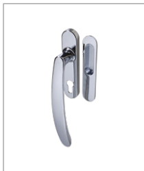
PC Polished Chrome