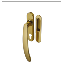
BP Polished Brass