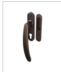
DBZ Dark Bronze