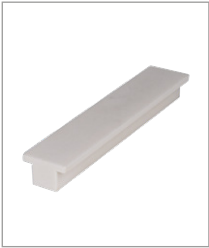
Euro Groove Infill Rail

Visit www.coastal-group.com for CAD drawings