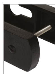
Stainless Steel Fixing