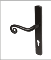
TMB Textured Matt Black