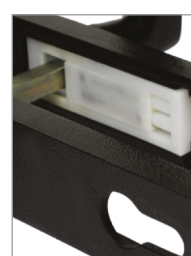
HD Spring Cassette